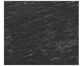
After Treatment with Dayli

Buy 4 Cases of Dayli... And Get a Fifth Case FREE!* That's a Savings of $89.95!